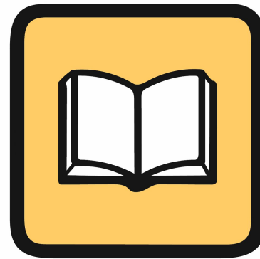
BOOK TEAM 2